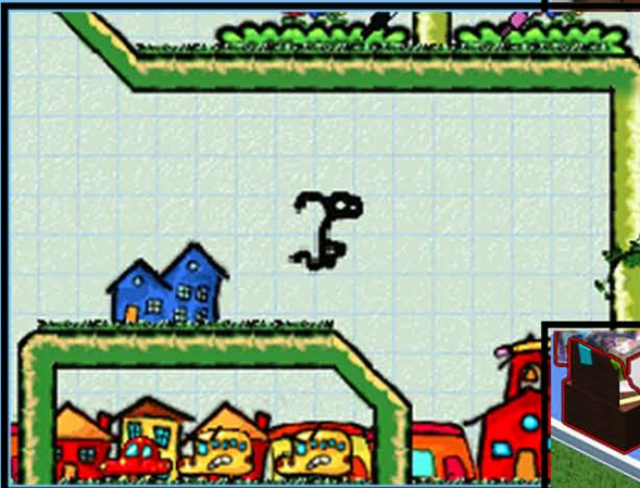
Marker Man Adventures - DS