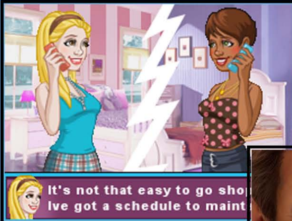
Clueless Fashion - DS