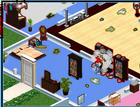
Babysitting Mania - DS

If, as the adage goes, a picture tells a thousand words, then our logo says it all. A translation of the ancient glyphs provides our company credo - We Create - and it is this credo that is the driving force of both our overall goal and our day-to-day activities.