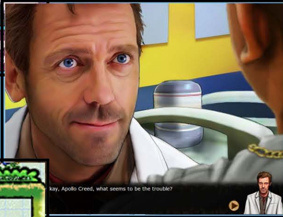
House M.D. - PC Flash